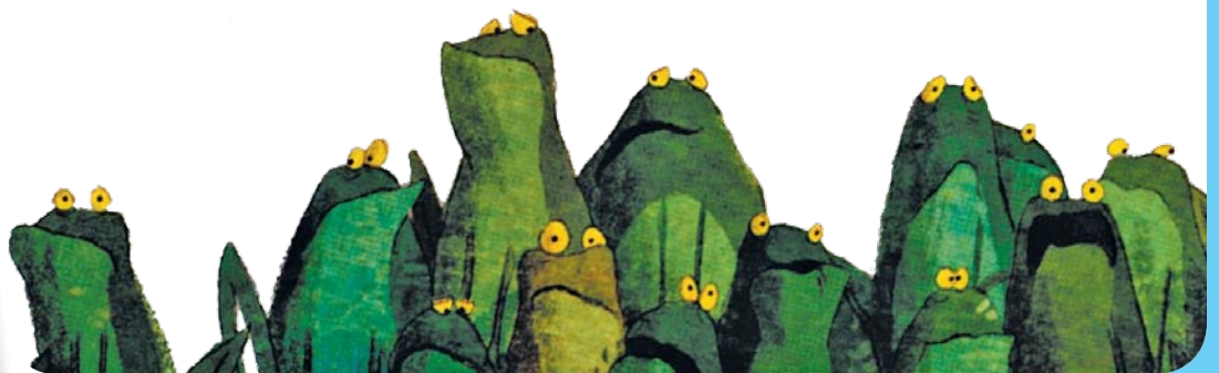
Illustration © 2012 by Poly Bernatene